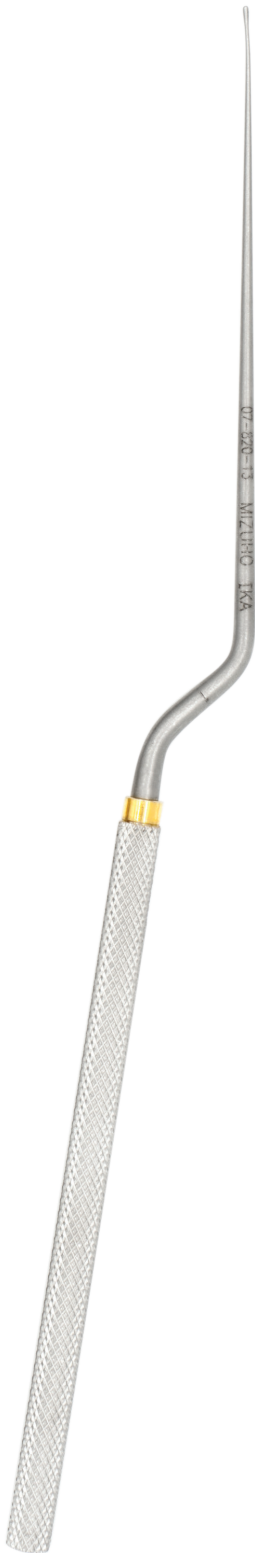
Shown above at 100% Scale Details shown larger