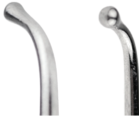
KELLY ENDOSCOPIC ENDONASAL PROBE