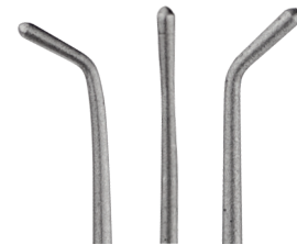
SKULL BASE PROBE MALLEABLE SHAFT 5) Bayonet Probe TL: 20.5 cm WL: 8 cm Tip Size: 3 mm Teardrop Malleable Shaft Round 07-820-18