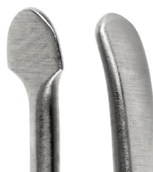
KELLY ENDOSCOPIC ENDONASAL COTTLE ELEVATOR TL: 20 cm Double-Ended 07-181-11MA

Shown above at 100% scale Details shown larger